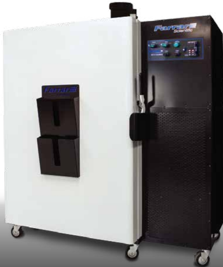
Model 4005, shown, with a 20.4 cu.ft. interior chamber designed for bulk freezing and thawing with customer specified profile.

Designed for high volume, accelerated bulk freezing and/or thawing of product under controlled conditions.